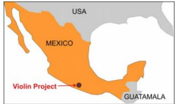
Figure 6: Location of the Violin Project

The Violin Project is in the Guerrero State of Mexico, about 250km south-west of Mexico City. A network of tracks makes most of the area accessible. The Project lies within the Guerrero Gold Belt which contains several major gold deposits and mines. Mineralisation in the area is related to gold bearing iron skarn porphyries and occur within faults and as replacement deposits formed in and around the igneous intrusions. VMS-style massive sulphide deposits, such as Campo Morado, also occur in the region. The project has outstanding potential for a large and significant gold-copper deposit.