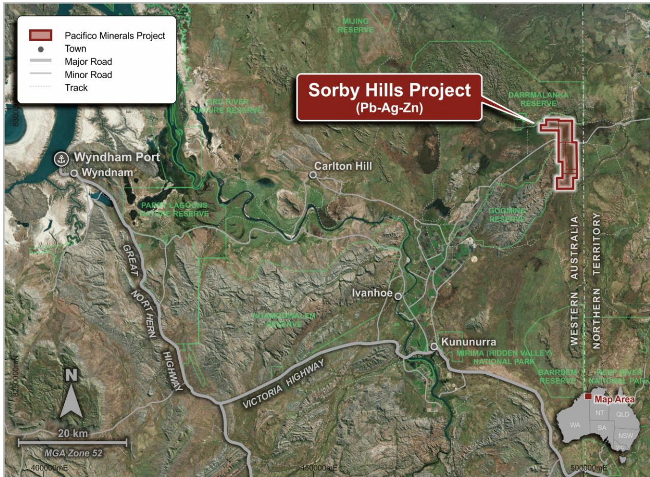
Figure 1. Location of the Sorby Hills Project approximately 50km northeast of Kununurra, Western Australia

Pacifco is now working with Joint Venture partner Henan Yuguang to increase the confidence in the resource estimate, update previous technical studies, undertake additional metallurgical testing to optimise the design of the process plant to produce a simple and clean concentrate and to comply with all regulatory requirements to complete a pre-feasibility study which envisages mining, processing and exporting base metal concentrate from the Port of Wyndham, (a road distance of approximately 140km from the Project area).