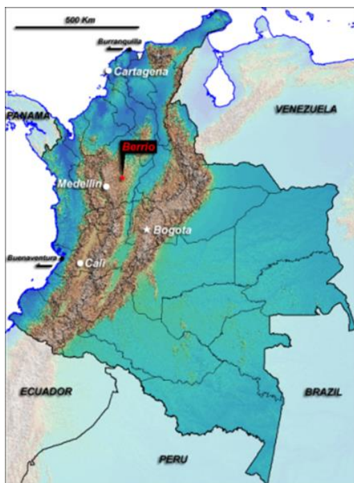
Figure 1: Berrío Location Map