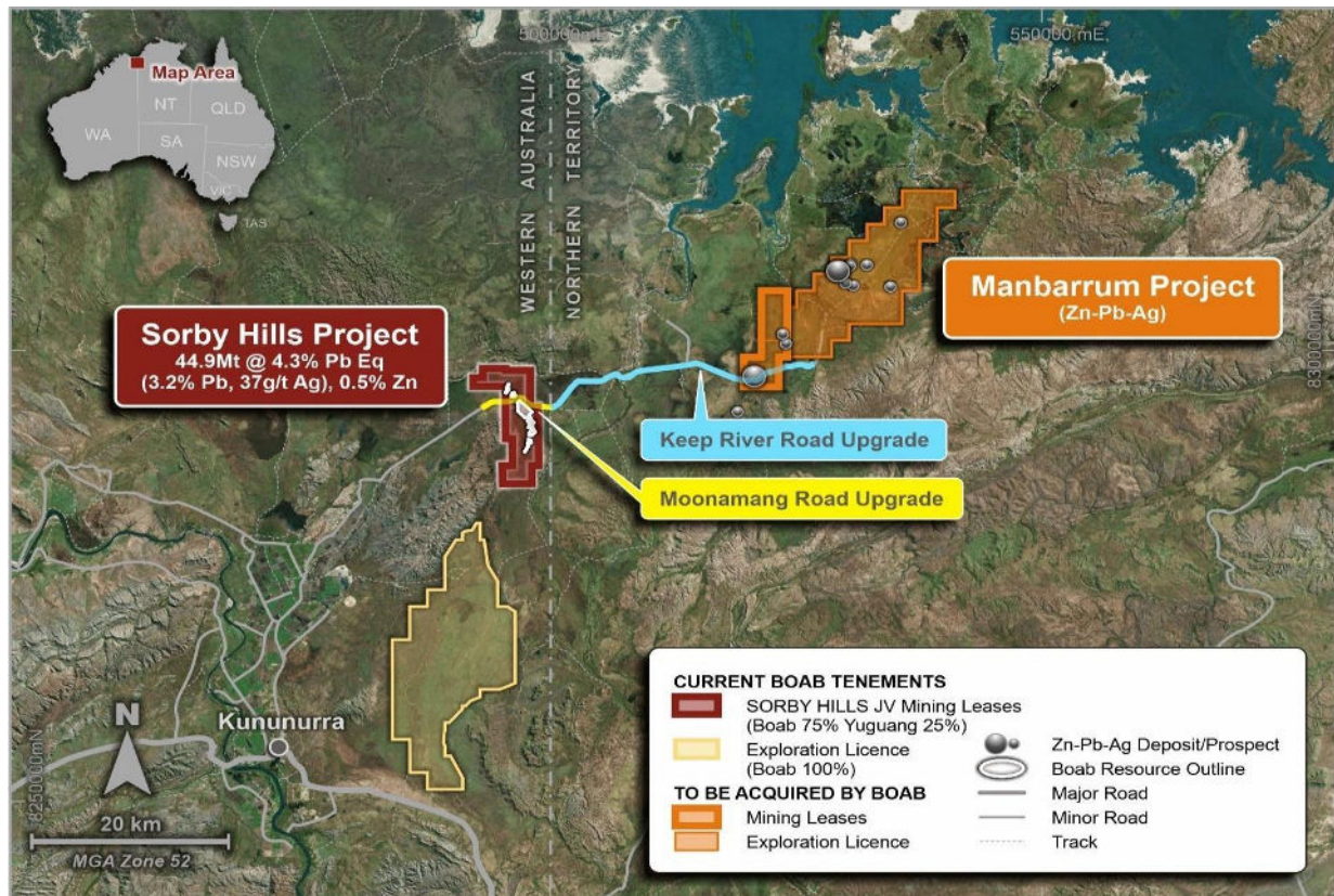
Figure 2 – Location of the Manbarrum Project relative to the Sorby Hills Project