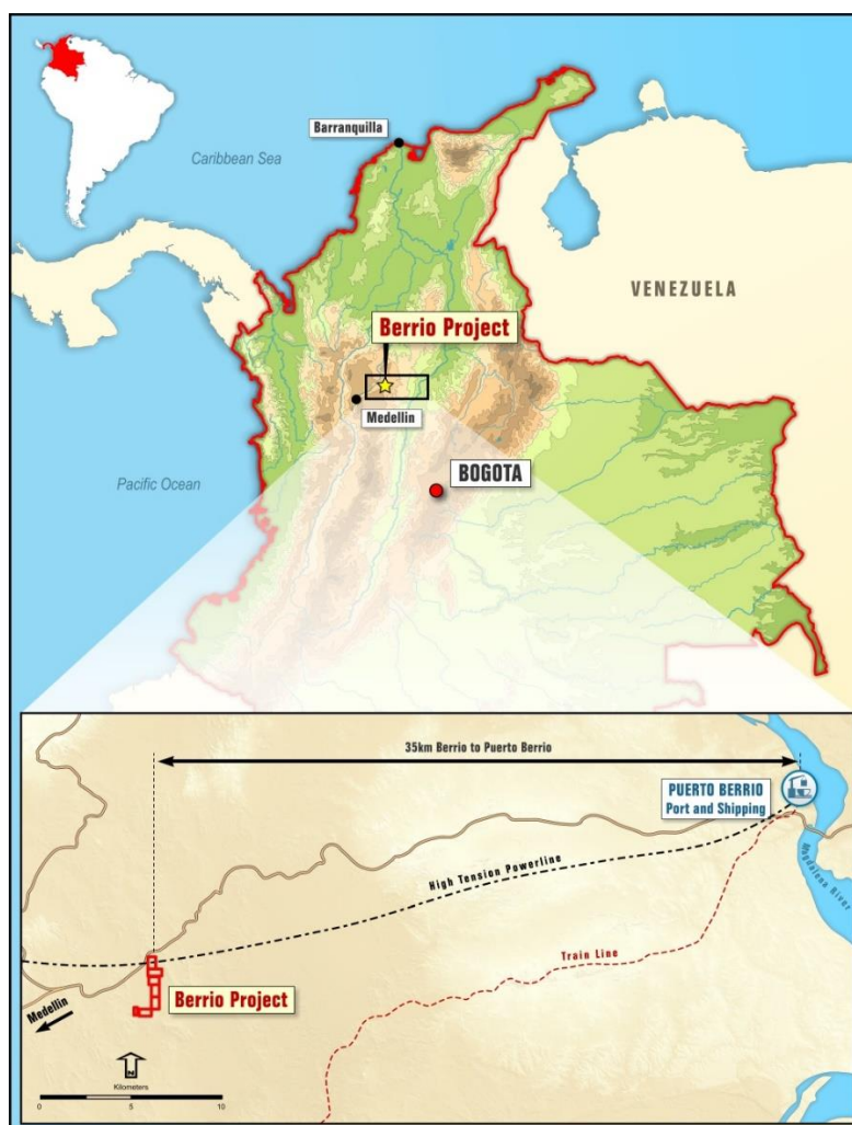
Location of the Berrio Gold Project and the excellent infrastructure in place

Planning for the maiden drilling program at Berrio is currently underway and is targeted to start during May 2014. Drilling will test the continuity of mineralisation through increasing depth, the apparent increase in grades at depth, and the general gold tenor across this wide zone of high grade mineralisation.