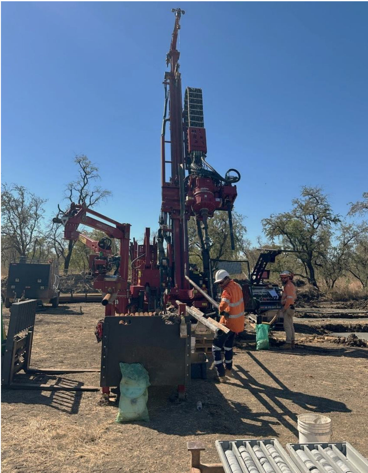
Figure 4: Photo of Sonic/Diamond drill rig on site at Sorby Hills