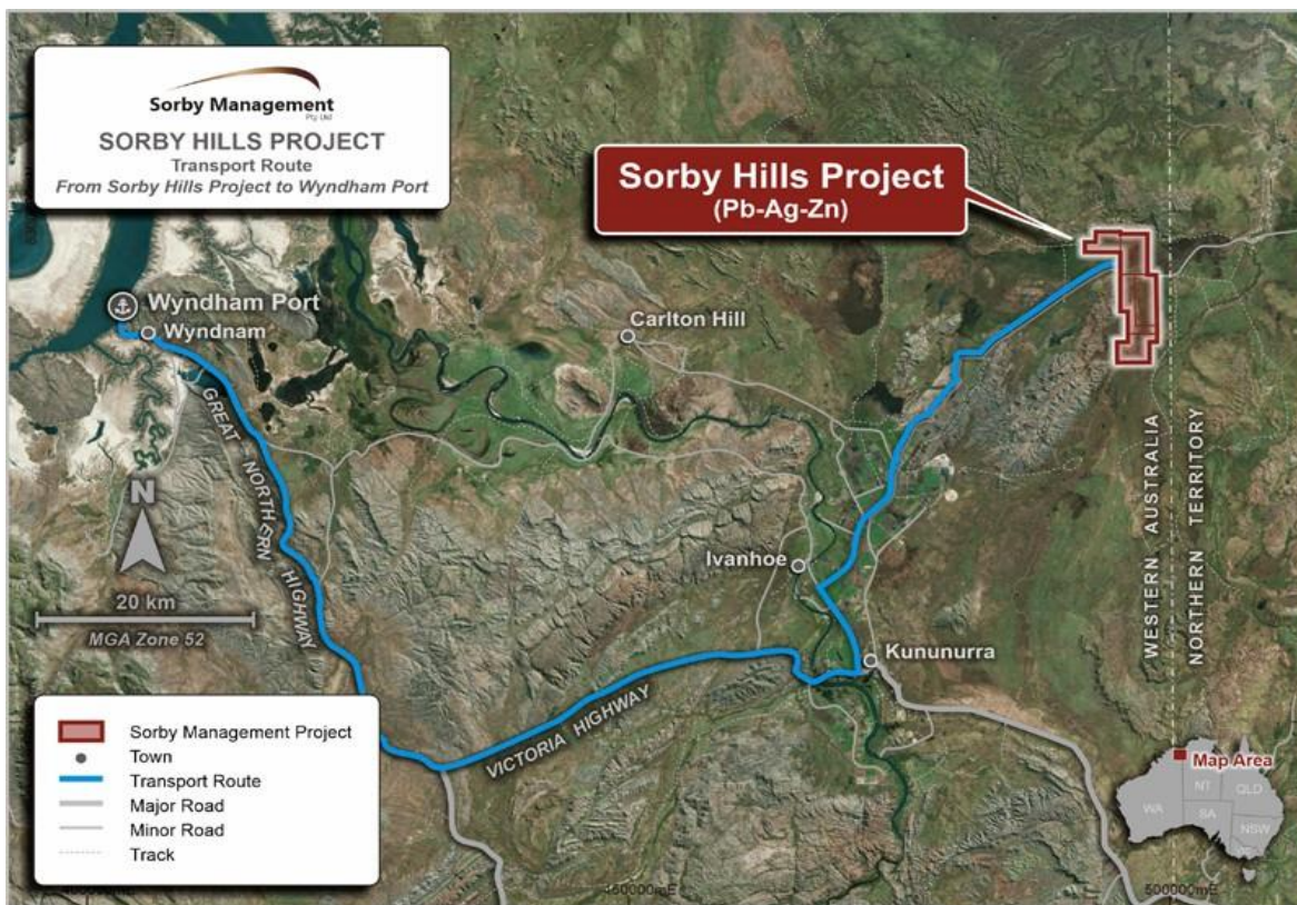
Figure 1: Location of the Sorby Hills Project